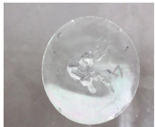
Figure 1: Carbopol gel

In our study a sonophor gel containing theophylline was prepared using a customized formula and then properties were evaluated. Gel rheology, the extent of drug release and gel potency was given the preferences during evaluation of gel properties. Figure 1 represents carbopol gel, Figure 2 represents gel rheogram and it showed a non Newtonian flow of the gel.