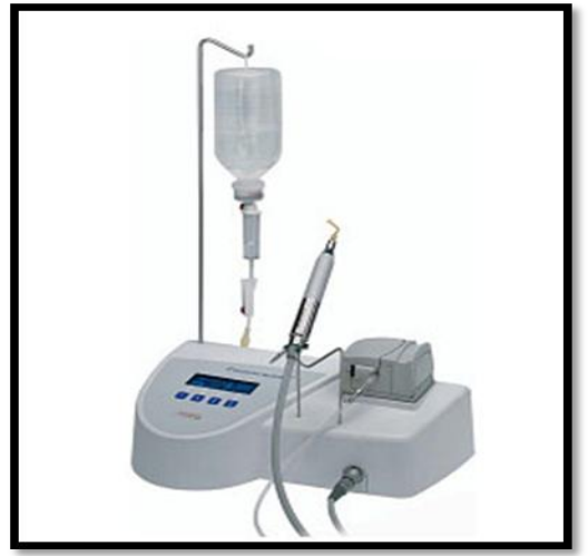
Fig 2: Piezosurgery device.<sup>15</sup>

haemostatis. The machine operates at 55,500 Hz and requires less energy than either cutting diathermy or laser. The instrument tip vibrates at amplitude of 50 µm to 100 µm. Vessels up to 2mm in diameter may be sealed by coaptation with the blade before division. No special training or precautions are required before using the self-cleansing device. It produces considerably less smoke or smell than either diathermy or laser, which reduces the need for instrument exchanges or smoke evacuation. Resterilization of the harmonic scalpel will allow it to be used on any number of patients and appreciably reduce the procedure related expenses after initial outlay. The device has been successfully used in both open and laparoscopic general surgical, gynecological procedures and for resections of squamous cell carcinoma of the tongue. A clear, relatively bloodless field was obtained with good visibility.<sup>7</sup>