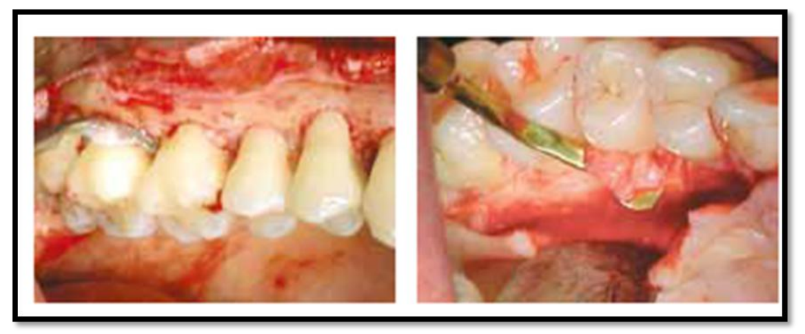
Fig 4: Periodontal surgery.<sup>16</sup>

(OP3) makes it easier to detach the secondary flap and remove inflammatory granulation tissue. This phase has little bleeding as the result of the cavitation of the saline solution (coolant). With the right inserts and power mode, the ultrasound device facilitates effective scaling. debridement, and root planing. In particular, debridement with a special diamond-coated insert enables thorough cleaning even for interproximal bone defects. The mechanical action of ultrasonic microvibrations. together with cavitation of the irrigation fluid (pH neutral; isotonic saline solution) eliminates bacteria, toxins, dead cells, and debris, which creates a clean physiology for healing. Healing is improved by applying ultrasound to produce micropits at the base of the defect to activate cellular response of healing mechanisms. The ability to work on the bone defect with magnifying systems makes it possible to exploit the benefits of piezosurgery microprecision in preparing the recipient site and stabilizing micrografts.