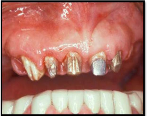
Fig.9: Preoperative view of the surgical site.<sup>21</sup>

Soft tissue crown lengthening can be accomplished easily with a laser when two conditions exist. First, there must be no need to contour the underlying bone; second, there must be sufficient attached gingiva so that there will be an adequate zone of attached gingiva after the soft tissue has been ablated. The existing bridge was used as a temporary prosthesis; soft tissue crown lengthening is required. The patient anesthetized with was 2% lidocaine containing 1:100,000 epinephrine. During the surgical procedure, a periosteal elevator was inserted between the gingival tissues