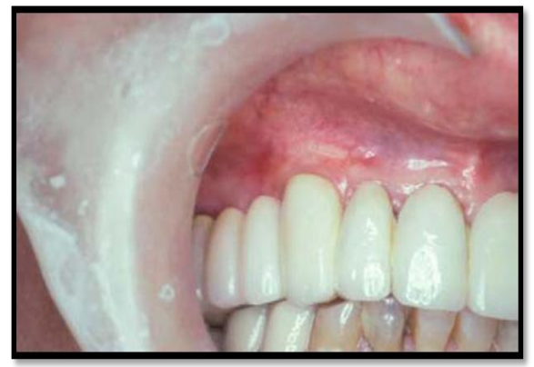
Fig. 8: The 3-week postoperative view shows the graft tissue blended into the adjacent attached gingival. ^{\rm 13}

Ishikawa I et al (2009) In their article discussed the application of lasers has been recognized as an adjunctive or alternative approach in periodontal and periimplant therapy. Soft tissue surgery is one of the major indications of lasers. CO2, Nd:YAG, diode, Er:YAG and Er,Cr:YAG lasers are generally accepted as useful tools for these procedures. Laser treatments have been shown to be superior to conventional mechanical approaches with regards to easy ablation, decontamination and hemostasis, as well as less surgical and postoperative pain in soft tissue management. Laser or laser-assisted pocket therapy is expected to become a new technical modality in periodontics. The Er:YAG laser shows the most promise for root surface debridement, calculus removal such as and decontamination. Concerning the use of lasers for bone surgery, CO2 and Nd:YAG lasers are considered unsuitable because of carbonization and degeneration of hard