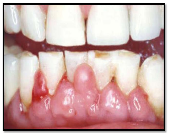
Fig. 4: A preoperative view of gingival enlargement caused by a calcium channel blocker. ^{\rm 13}

with 2% lidocaine with 1:100.000 epinephrine. A periosteal elevator was placed between the tissue and the tooth to protect the hard tissue from the effects of the CO2 wavelength. Lasing was performed with a CO2 laser in a 7-W continuous wave mode. The slight amount of interproximal bleeding, which was due to the fact that the finger-like projections of the hyperplastic tissue contained capillaries that were larger than the diameter of the lasing beam. A biologic bandage (char layer) was placed over the surgical site, eliminating the need for a periodontal dressing.<sup>13</sup>