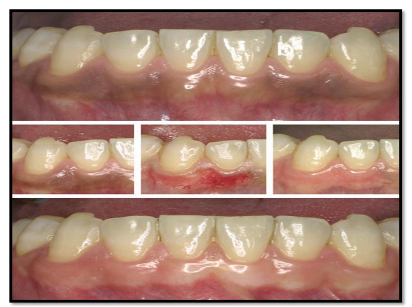
Fig.3: Removal of gingival melanin hyper pigmentation using an Er:YAGlaser.<sup>6</sup>

Lasers can be applied in esthetic procedures such as recontouring or reshaping of gingiva and in crown lengthening. With the use of some lasers, the depth and amount of soft tissue ablation is more precisely and delicately controlled than with mechanical instruments. In particular, the Er:YAG laser is very safe and useful for esthetic periodontal soft tissue management because this laser is capable of precisely ablating soft tissues using various fine contact tips, and the wound healing is fast and favorable owing to the minimal thermal alteration of the treated surface. Depigmentation is another indication for laser use in esthetic treatments. The CO2, diode and Nd:YAG lasers can treat melanin pigmentation effectively. However, in areas of thin gingiva, these lasers have a risk of producing gingival ulceration and recession as a result of their relatively strong thermal and /or deeply penetrating effects . In these situations, the Er:YAG laser is more useful and safe for melanin depigmentation.<sup>9</sup>